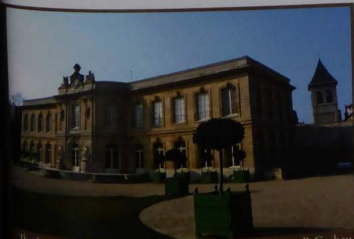
The château of Asnières-sur-Seine (1750-1752) today

Faced with a lack of public esteem and low support from the royal administration, he decided to invest his own personal fortune. "It was to resolve these drawbacks and many others", he states, "that in 1752 I decided to set up on the banks of the river Seine some eight hundred or a thousand yards above my house at Asnières a general establishment where horses would be collected together in order to breed stallions, and to train and care for them until they reached the official age as prescribed in the various ordinances, especially the 1717 ruling whose directives on this matter are both sound and sensible".