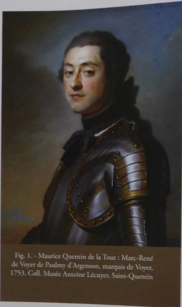
Fig. 1. - Maurice Quentin de la Tour : Marc-René de Voyer de Paulmy d'Argenson, marquis de Voyer, 1753.