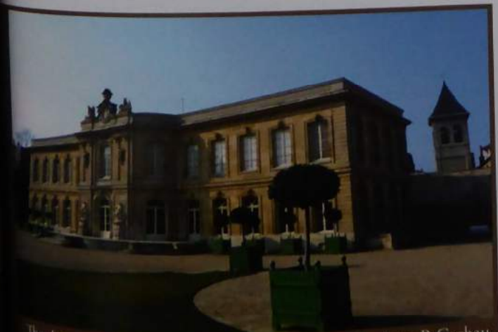
The château of Asnières-sur-Seine (1750-1752) today

Faced with a lack of public esteem and low support from the royal administration, he decided to invest his own personal fortune. "It was to resolve these drawbacks and many others", he states, "that in 1752 I decided to set up on the banks of the river Seine some eight hundred or a thousand yards above my house at Asnières a general establishment where horses would be collected together in order to breed stallions, and to train and care for them until they reached the official age as prescribed in the various ordinances, especially the 1717 ruling whose directives on this matter are both sound and sensible".